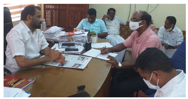
Discussion with Corporation Mayor