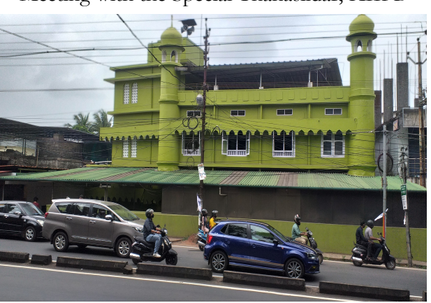
Affected Muhammad Masjid