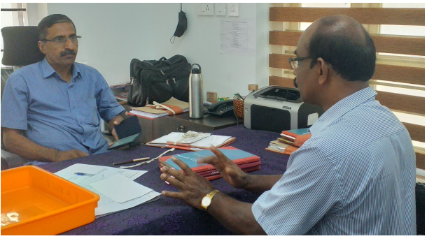
Meeting with the Special Thahasildar, KIIFB