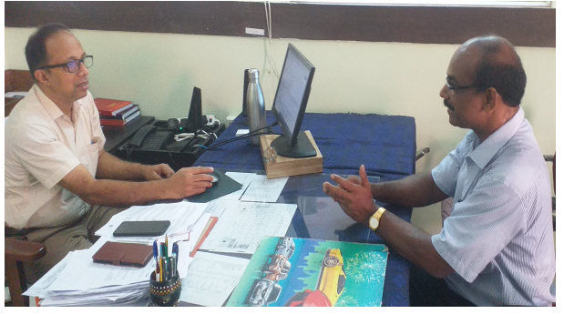
Meeting with the Dy. Collector (LA)