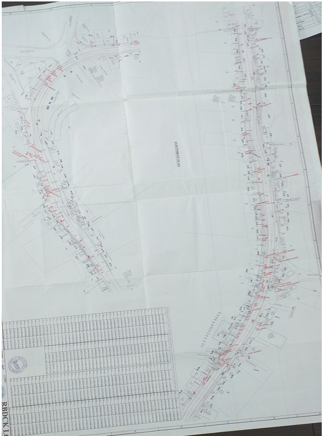
Sketch plan of the Thekki bazar flyover