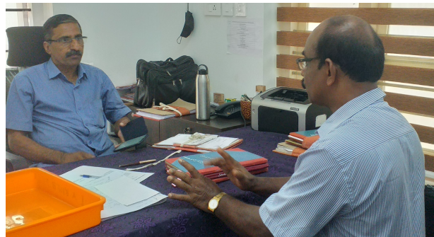
Meeting with the Special Tahasildar, KIIFB