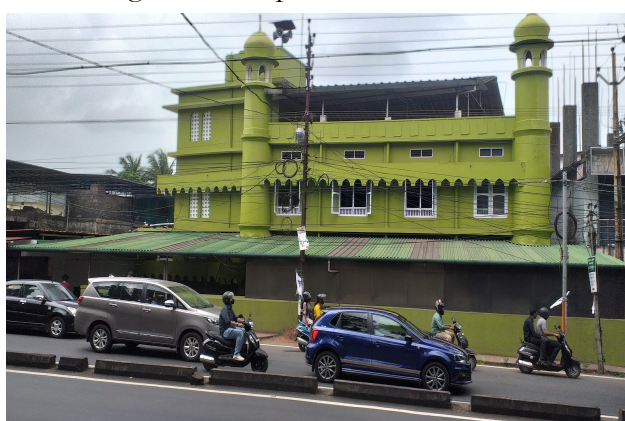
Affected Muhammad Masjid