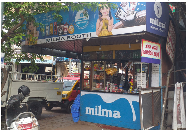
Affected Milma Booth