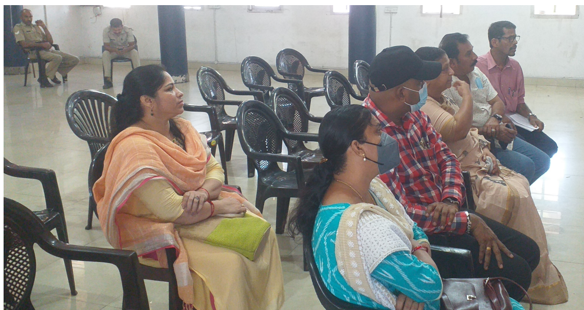
Second Public hearing conducted with police protection

The Corporation Ward Councillor addressed the gathering by saying that government should give higher compensation than which is permissible under the RFCTLARR Act-2013 to the affected. Because the directly affected and indirectly affected people who are having livelihood in the affected area or people, who are employed there, would be affect very badly. The completion of the flyover would take longer time till then the affected would be in income loss.