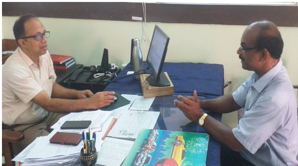
Meeting with the Dy. Collector (LA)