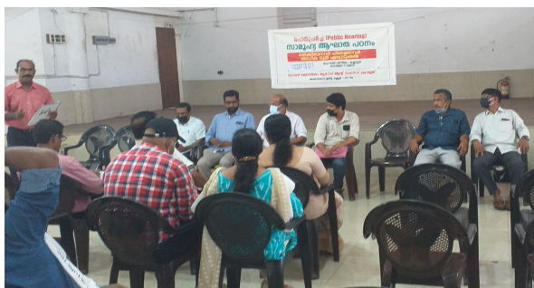
SIA Unit Coordinator explaining the findings