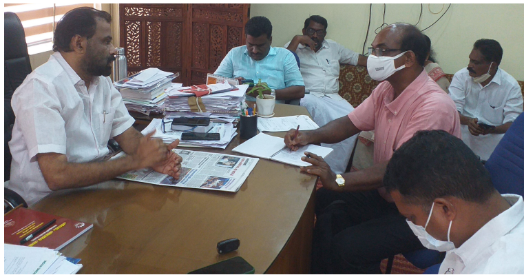
Discussion with Corporation Mayor