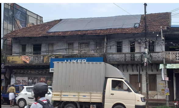
Affected property (old BEVCO building)