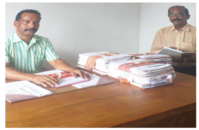
Discussion with Special Thahasildar (KIIFB)