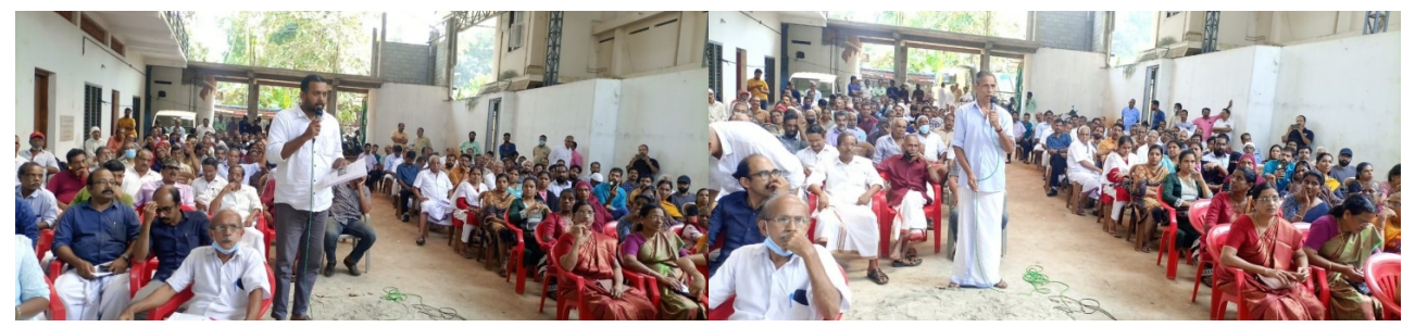
Response by the affected

Conclusion: the entire affected are willing to give their land and properties for the AIIMS project at and those who responded in the Public hearing too. All are welcoming the AIIMS but considering the potential development in the area they demanded a special package/ compensation for their loss and job should be reserved for the evictees as per their merits and capabilities. The shop buildings and Madrassa and also the temple must be exempted from acquisition. The affected family health centre must be relocated in the nearest place. Students of the evictes must be given reservation for the cources in AIIMS. After the acquisition the abandoned houses would become a space for anti social elements to come up and locals might be disturbed. It should be checked.