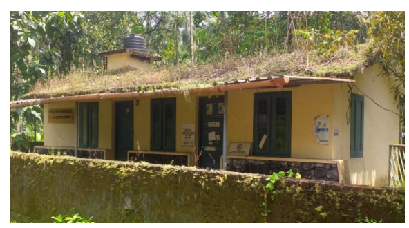
Affected family health centre