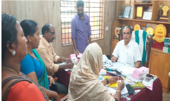
Meeting with Panangad panchayath President