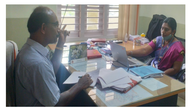
SOME STILLS FROM THE AREA AND SIA PROCESS

The data obtained from the survey was analysed to provide a summary of relevant baseline information on affected populations - all types of project impacts which include direct and indirect impact of physical and or economic nature on the people and the general environment. The responses received from the community, the local administration and representatives of government departments through the public consultation and socio-economic survey are represented in the subsequent chapters of this report.