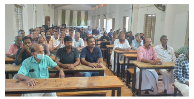
Focus group discussion with the affected