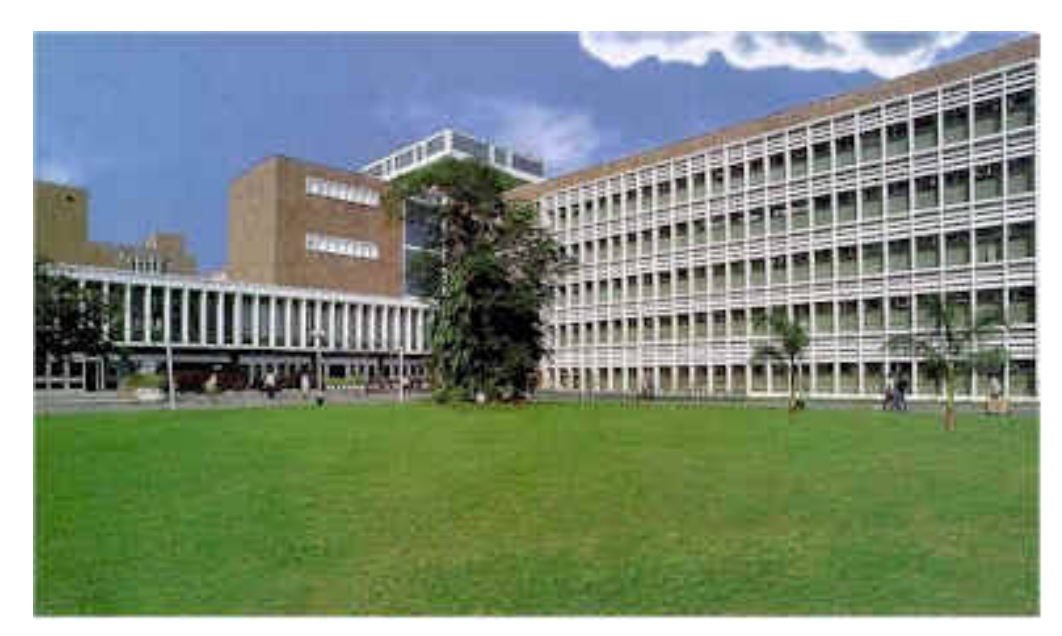
SUBMITTED TO THE DISTRICT COLLECTOR KOZHIKODE

In Kinalur - Kanthalad Villages of Thamarassery Taluk, Kozhikode District