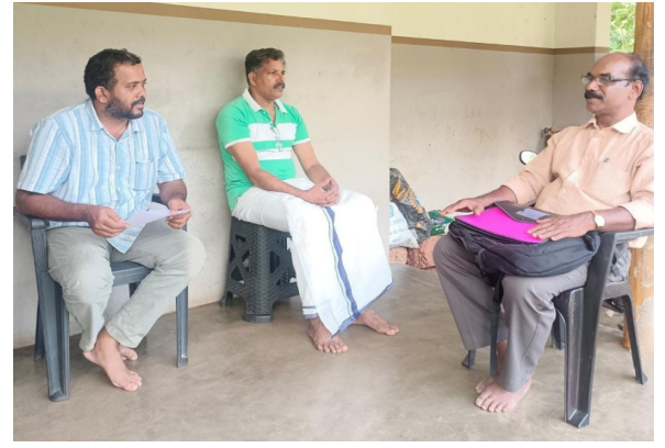
Meeting with the affected