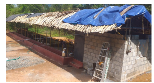
Affected dairy farm